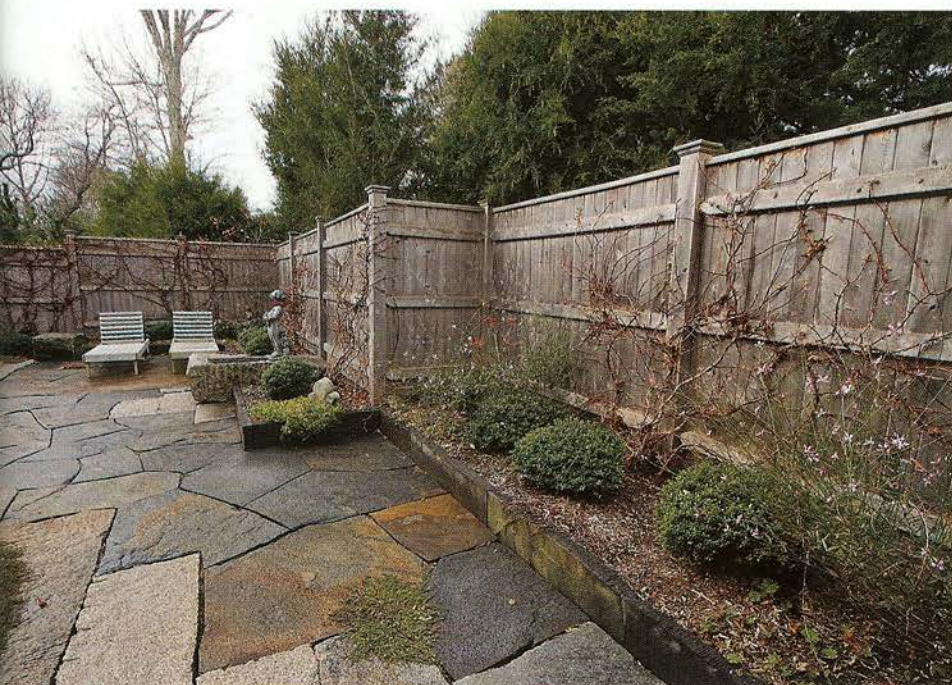
Vine-covered fencing wraps an irregular stone patio to enhance privacy and evoke a sense of seamless integration with the trees and the natural landscape beyond.

season, when not in bloom. She loves to “create drifts” of color and texture. She has some favorites. Ornamental grasses top the list.