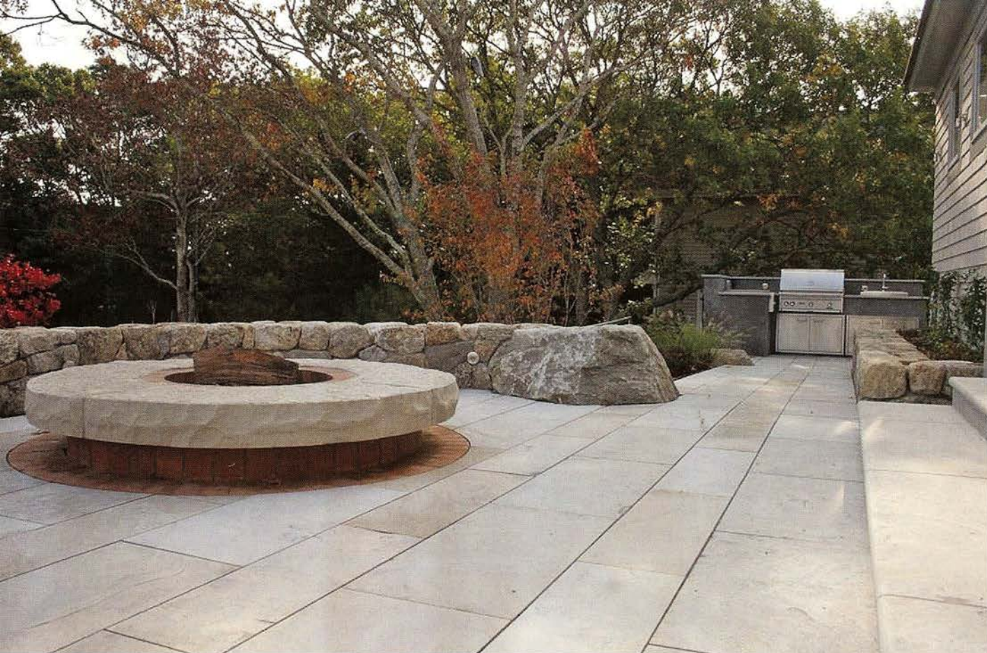
A stone fire pit and a rock wall are the climactic elements in a patio design that features brickwork, linear-laid stone and, at the far end, a grill and sink which underscore the use of the out-of-doors as a living space, intrinsic to the lifestyle of those who dwell within.