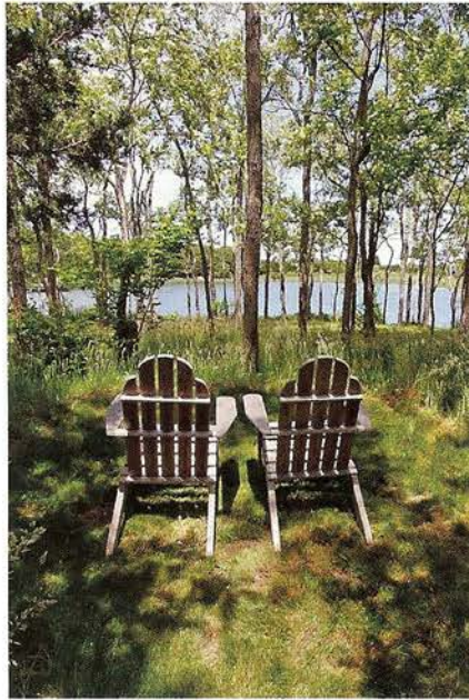
Even the addition of two simple Adirondack chairs can transform a small grassy spot in a low-maintenance backyard landscape into a magical, welcoming glen.

Another frequent request: Many homeowners want to go organic, ready to give up synthetic and chemical fertilizers for something that is safer for the environment.