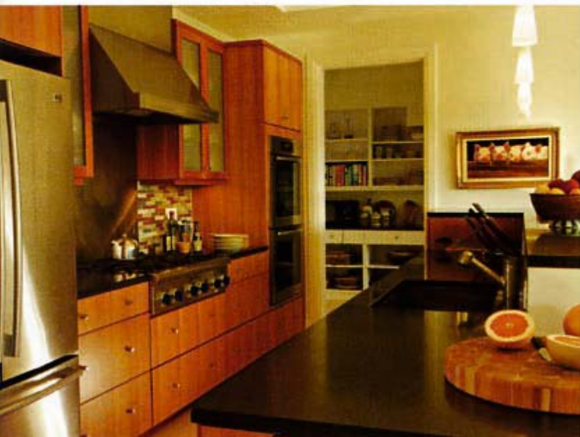
Left: The kitchen was renovated shortly before the Taylor's decided to tear down the original ranch house and rebuild. Below: In the unique landscape designed by Mary LeBlanc, astilbe, lace cap and oak leaf hydrangeas, and beach roses signal high summer. In the fall, purple smoke bush, shadblow, a Japanese maple, and grasses saturate the site in color.