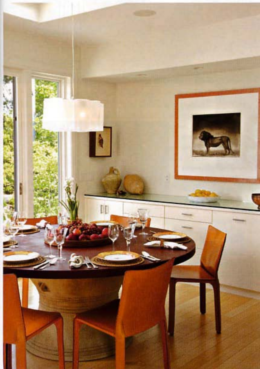
Above Top: This unique staircase was built by Peter Noyes, is made of mahogany and has stainless steel marine railings creating a unique look that flows with the rest of the home. Above: Hermès table settings continue the African theme even while dining.