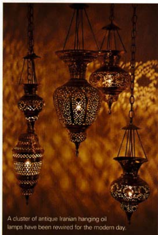
A cluster of antique Iranian hanging oil lamps have been rewired for the modern day.

The property itself presented a host of obstacles. Janovsky notes that usually "architects and homeowners bring up the landscape as a cosmetic detail at the end," but in the case of the Taylor home, the landscape design was an immediate consideration. As the property comes under the jurisdiction of state and local conservation restrictions as well as the New Seabury Architectural Review Committee, the