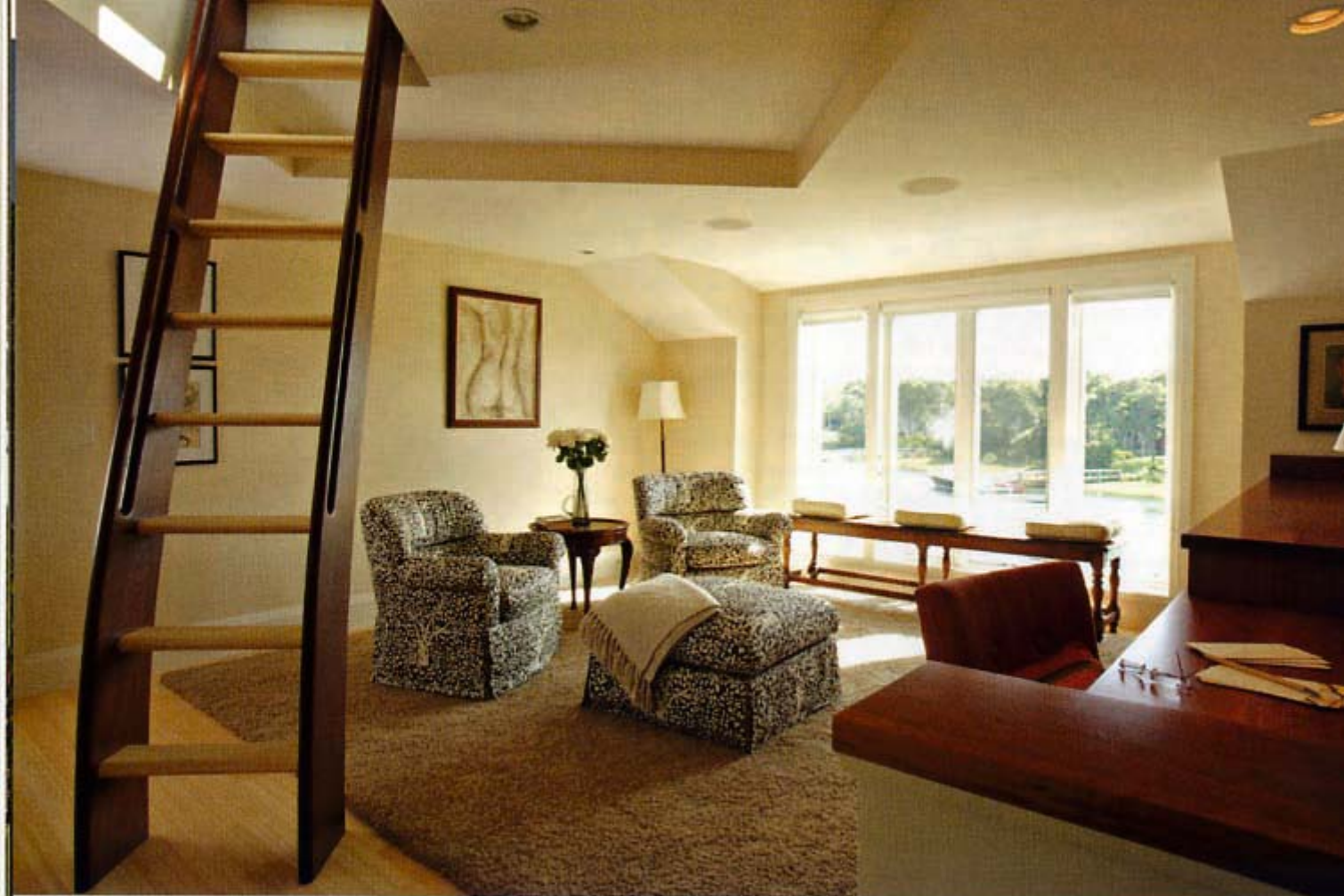
Below: This two-hundred-year-old Mexican carousel horse greets visitors. Above: This relaxing sitting room has a panoramic view of the water. The marine railing was used on the windows to create a unifying effect with the staircase and deck railings. The beautiful handcrafted ship's ladder leads to a twisting cupola.

master bedroom is a bit more Continental, infused with Far Eastern influences arising from a collection of miniature Japanese tea pots and Japanese quince fabric on the two armchairs.