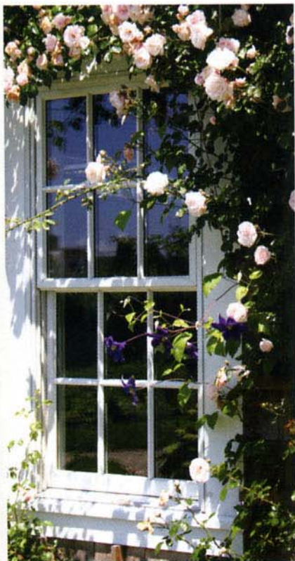
(Above and left) More 'new dawn' roses surround the windows of this house, while hydrangeas and meticulously trimmed dwarf boxwood greet a visitor approaching the front door.