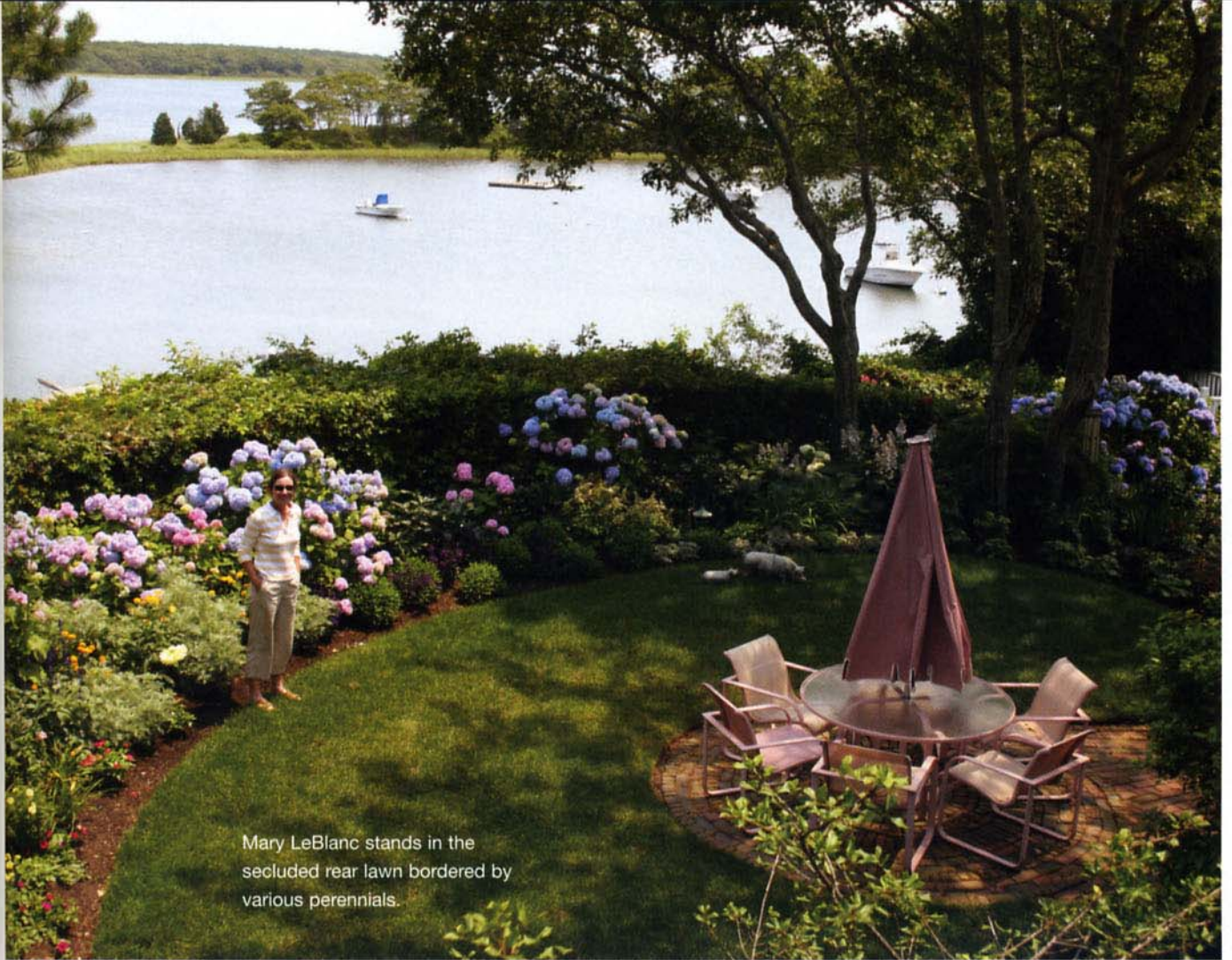
Mary LeBlanc stands in the secluded rear lawn bordered by various perennials.