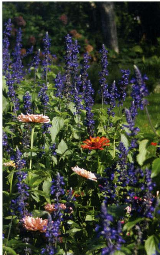
(Right) Pink and orange zinnias and blue salvia reach up to the sky.