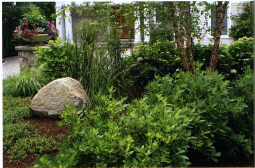
This house on a tiny waterfront lot wraps around a granite patio with a sunken gunite spa. Cast limestone planters created by Terri Navickus of Horticultural Services in Marstons Mills, feature wave petunias, dipladenia, "black and blue" salvia and oat grass.