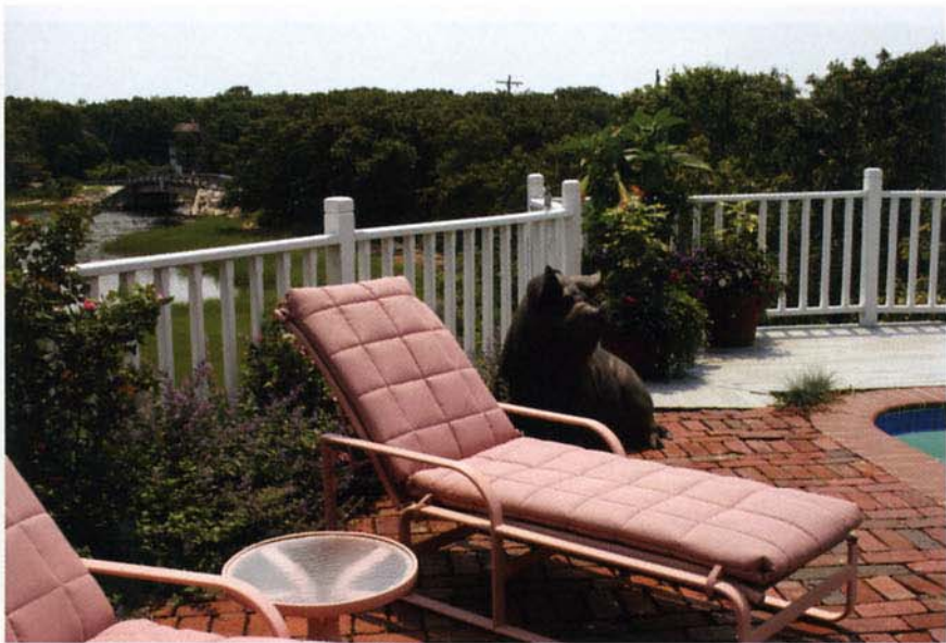
(Above) A pig sculpture and potted roses and cat mint surround the pool's patio.